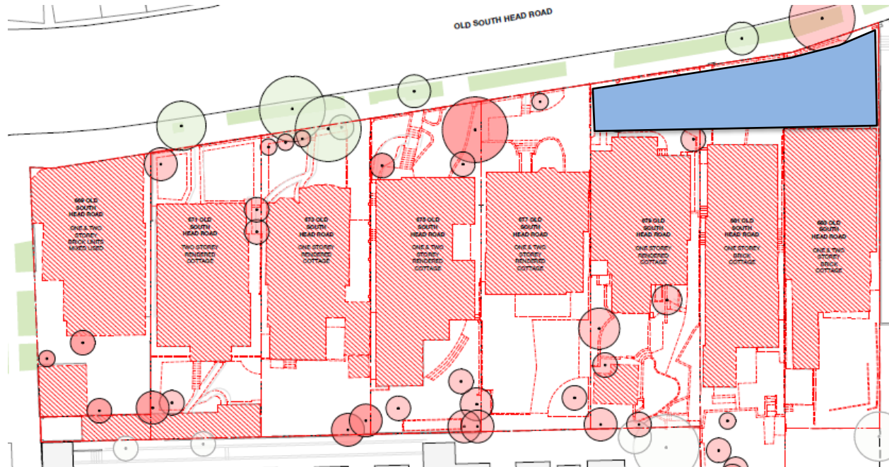
Figure 3. The highlighted space shown will be utilised as an internal materials storage space.

The indicative space is highlighted in figure 3 below with a blue box. Considering this space will see little development directly on top it will provide a useful area to store these items throughout the demolition and construction phases of the project.