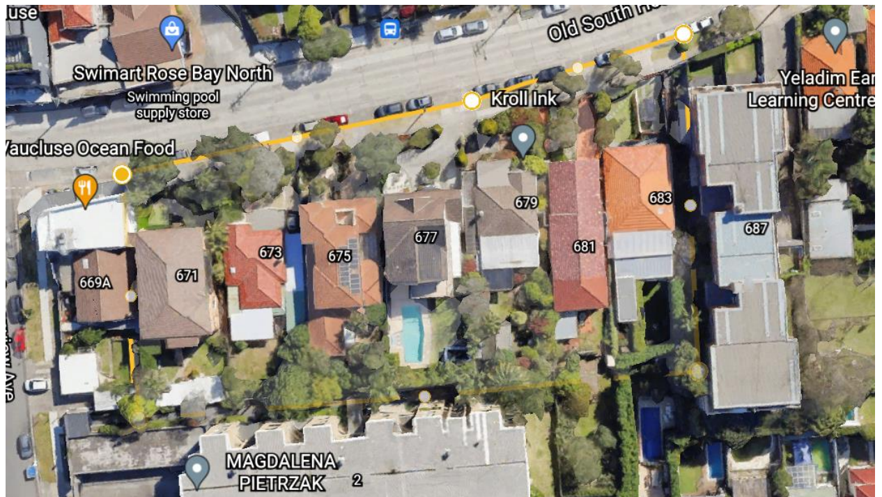
Figure 1: Existing Structure

The site of the proposed development is currently occupied by a series of one to two-storey brick rendered cottages from 669-683 Old South Road. Estimates of the volumes of waste expected to be produced by demolition of the existing building is based on these parameters.